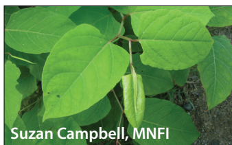
Suzan Campbell, MNFI

Its leaves are simple, alternate and broad, typically growing up to 15 cm (6 in) long and 12 cm (5 in) wide. They have an abruptly pointed tip and a flat or tapering base.