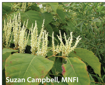
Suzan Campbell, MNFI

Knotweed has numerous, small, creamy white flowers. They are arranged in spikes near the end of the plant's arching stems. In Michigan, they bloom in August and September. Knotweeds are insect-pollinated.