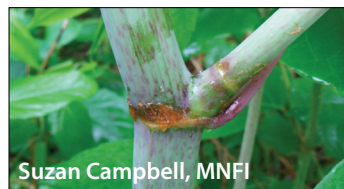
Suzan Campbell, MNFI

Japanese knotweed stems are upright, round, hollow, and often mottled, with a fine whitish coating that rubs off easily.